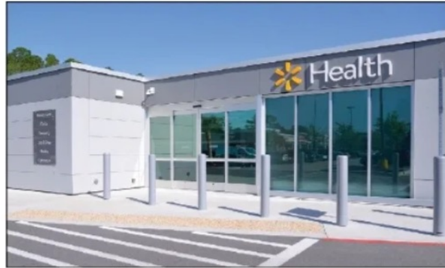
Offerings range from primary care to labs, X-rays and dental services.

The state-of-the-art health centers are capable of delivering services beyond the diagnostic tests and immunizations